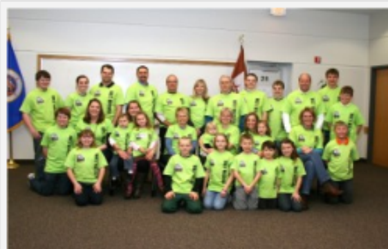
Six families made up Wright-Hennepin's energy-savings team in "The Littlest User" contest.

When it comes to reducing energy consumption, wet hair can be an important ally.